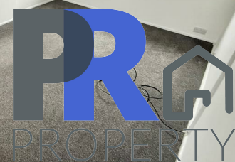
25 Sir Herbert Janes Village, Luton, LU4 9HS £1,032 PCM